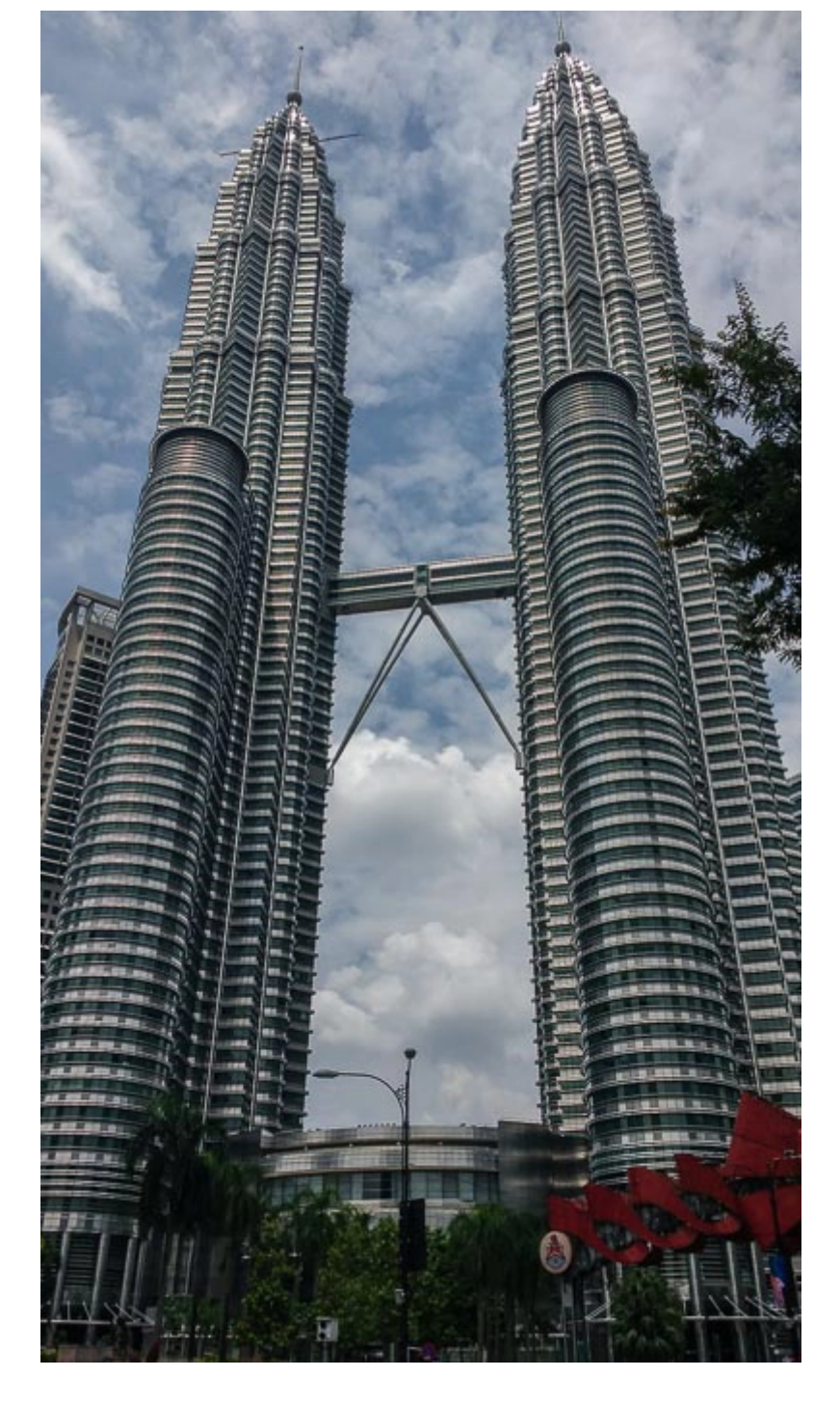
1. Petronas Twin Towers, the most popular attraction in Kuala Lumpur

Inside the Petronas Towers, at the ground level, be sure to check out Suria KLCC , an upmarket retail center with 380 stores, the largest in Malaysia. It includes a concert hall, an art gallery, and The Discovery Center , a science and technology museum that is a great visit to do in Kuala Lumpur with kids .